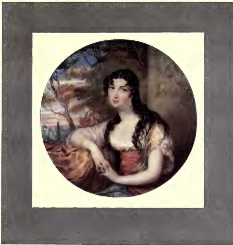
THE COUNTESS OF JERSEY BY SIR GEORGE HAYTER (1819)